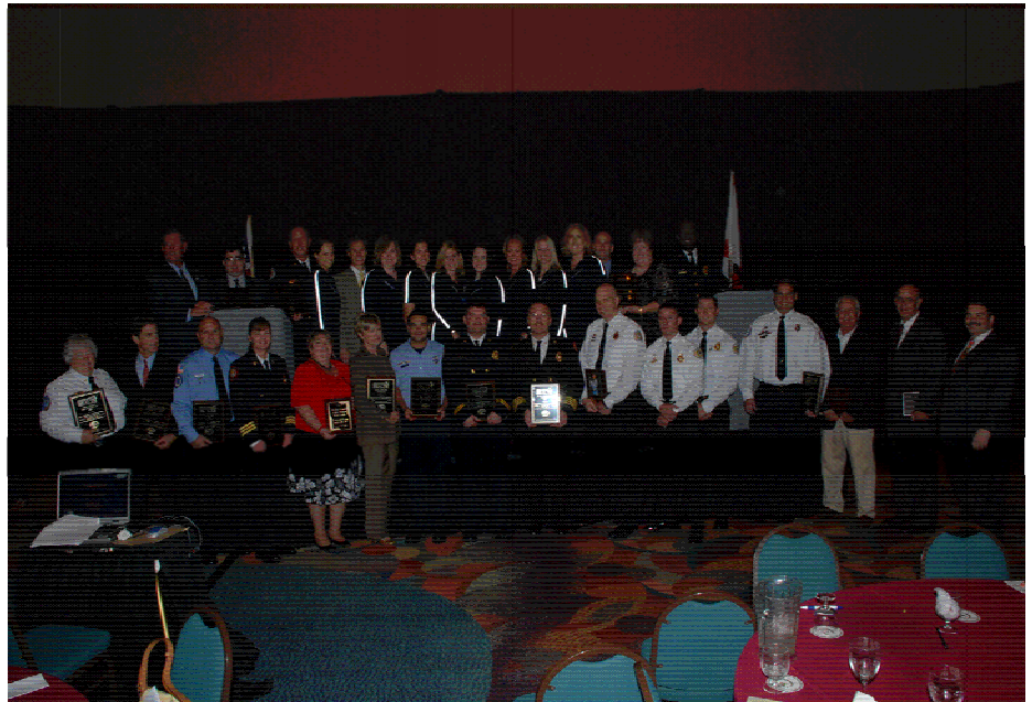
EMS State Award Winners