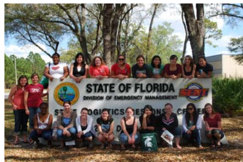
Michigan State University Students

other group of 100 volunteers worked a total of 224 hours this past March to assemble 34,000 kits. Volunteers consisted